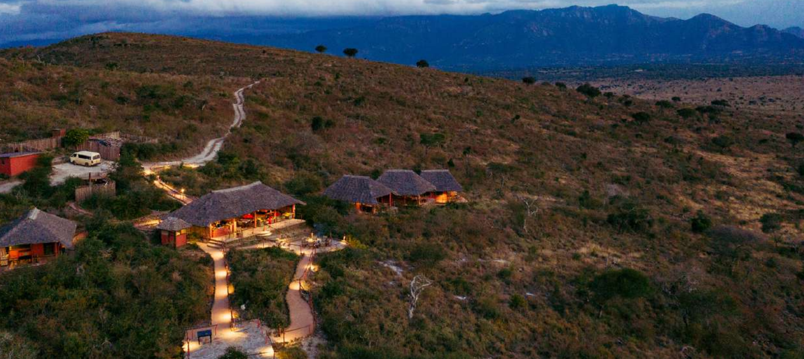
LEOPARDS LAIR - 4 COTTAGES